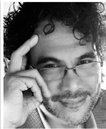
Introduction to the Book By Ramil Cueto